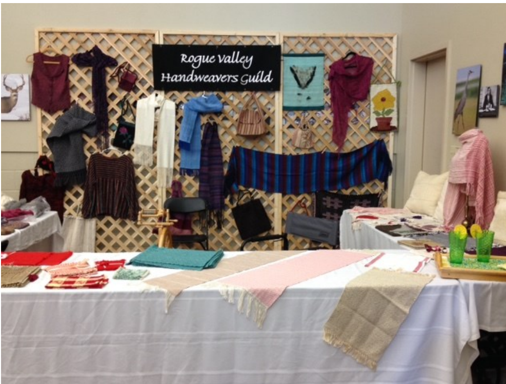
Our lovely booth!

Thanks to the following RVHG members who volunteered at the fair: